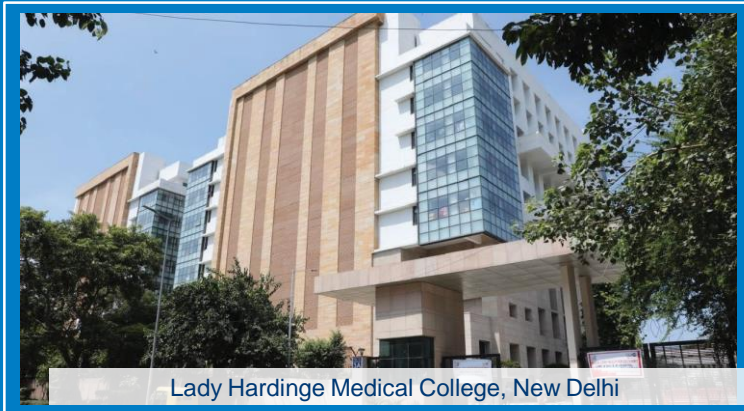
Lady Hardinge Medical College, New Delhi