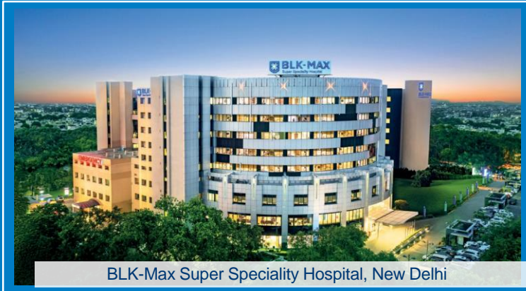
BLK-Max Super Speciality Hospital, New Delhi